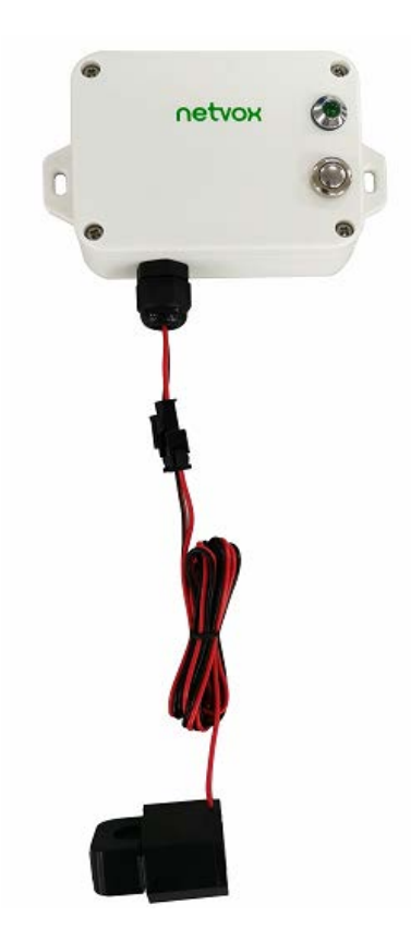
R718N17E (detachable cable)