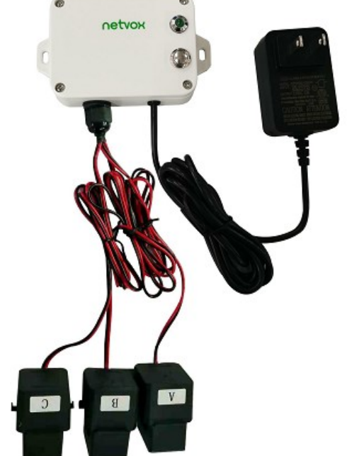
R718N315D (Non-detachable cables)