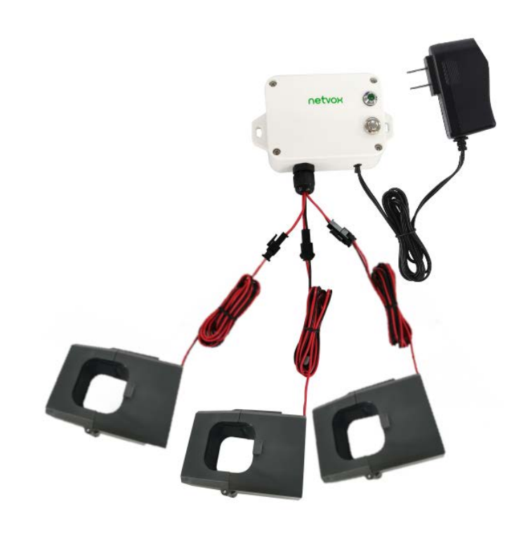
R718N3100DE (Detachable cables)