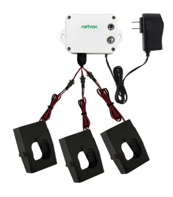
R718N363DE (Detachable cables)