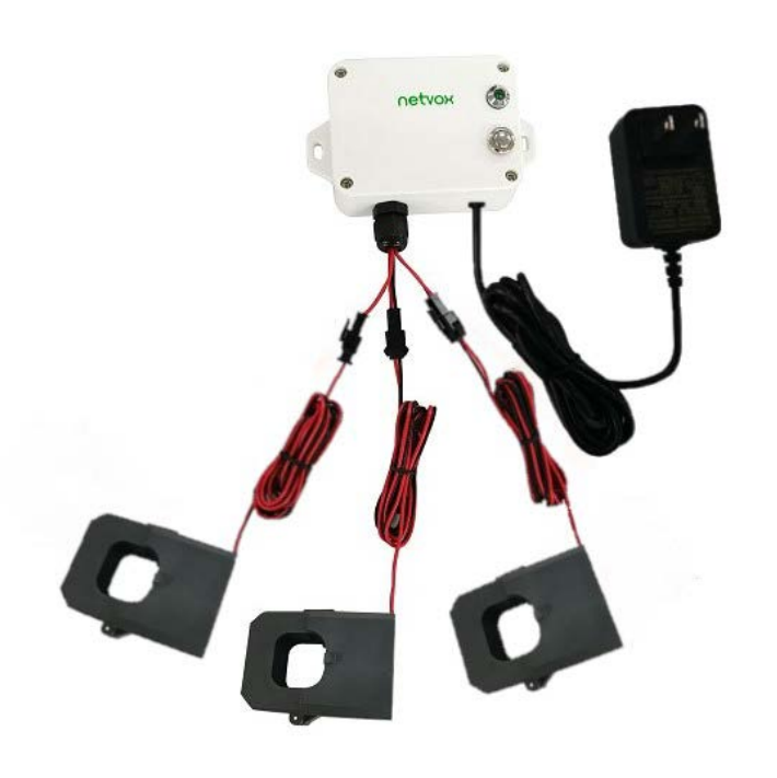
R718N325DE (Detachable cables)