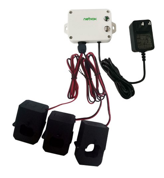
R718N325D (Non-detachable cables)