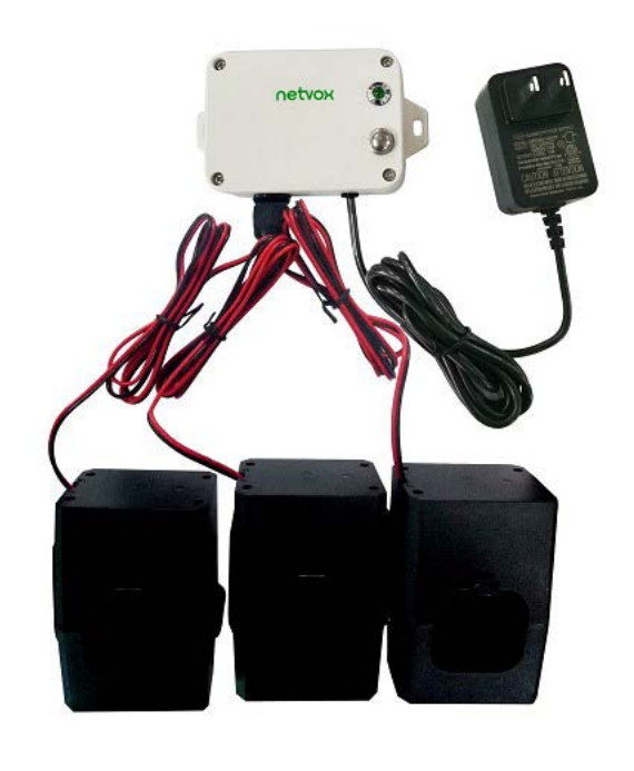
R718N363D (Non-detachable cables)