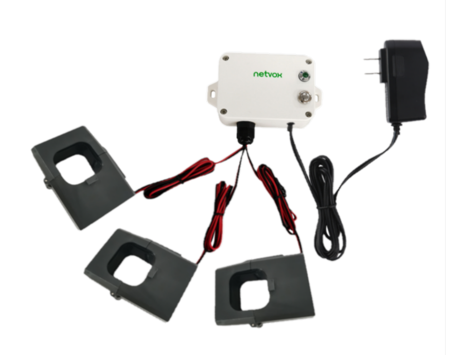
R718N3100D (Non-detachable cables)