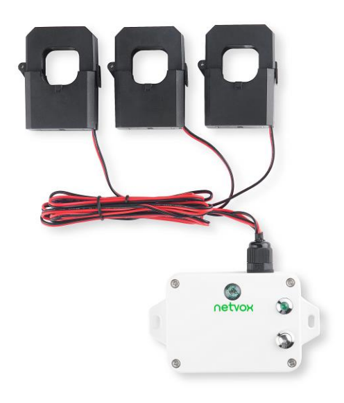
Figure 1 R718NL325 Appearance

Wireless Sensor Network Based on LoRa Technology