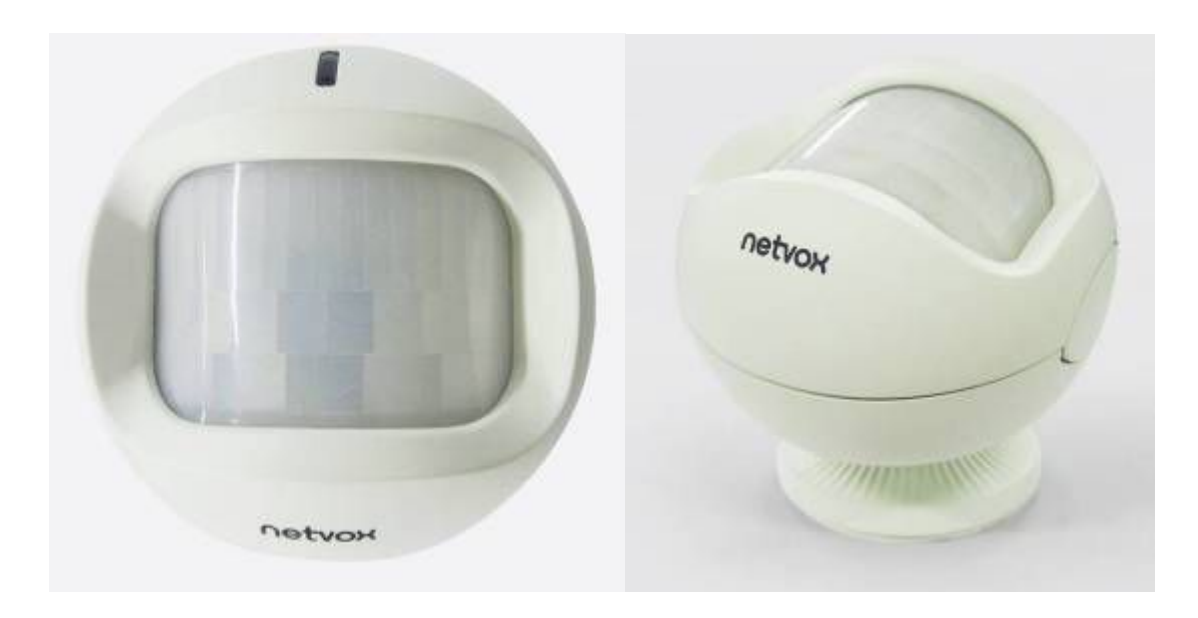
Fig. 1 ZB11 Appearance

This document contains proprietary technical information which is the property of NETVOX Technology and is issued in strict confidential and shall not be disclosed to others parties in whole or in parts without written permission of NETVOX Technology. The specifications are subjected to change without prior notice.